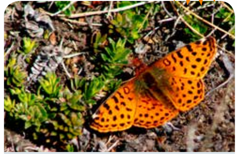
Queen of the Falklands fritillary - the caterpillars of our native butterfly like to feed on the leaves of violets.

☼ Fossil records show that there were no grazing mammals on the Falklands until cattle were introduced in the 18th century. Our 14 endemic plants (these are plants found only in the Falklands) lived for thousands of years without grazing mammals. Most do not have defences like spines or terrific seed production and so they need protection from grazing to flourish - this is why species like native boxwood, snake plant and Falkland lavender are only found on cliff edges or in stone runs and mine fields. Fencing off some wildlife areas (and avoiding grazing new areas) allows these unique plants to spread and form their own special Falklands habitats.