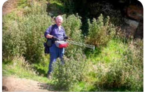
Hoe no! Thistles are a pest to agriculture. (BRIAN SUMMERS)