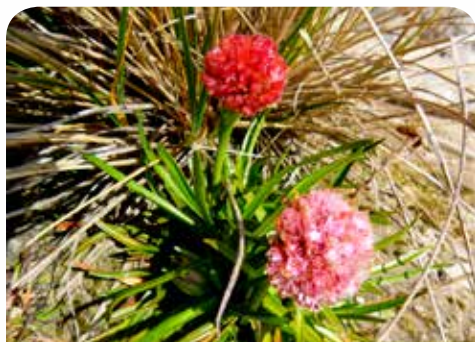
Falkland Thrift on a clay patch at Cape Pembroke.