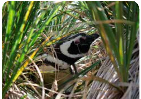
A Magellanic penguin peers through dense tussac.

Good native plant habitat – sunshine cliffs! Falklands woolly daisies as far as the eye can see at Shallow Harbour Farm. These brilliant yellow flowers are unique to the Falklands (MARLANE MARSH)