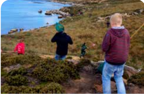
Consider hosting a Watch Group visit.

take photos and share them on social media. Encourage tourists to do the same. Think about hosting a Watch Group trip to enthuse children.