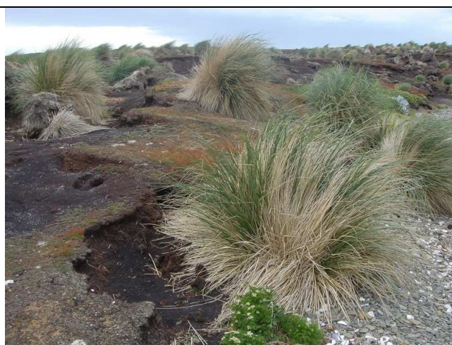
Limited regrowth of Tussac and Wild Celery by the southern shore following overgrazing 599