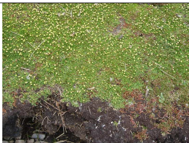
Buttonweed and a little Sheep's Sorrel covering hard peat surface, south coast 604

Only 16 of the 75 flowering plant species so far recorded on Middle Island are non-native, a lower proportion of introduced species (21%) than often found on heavily grazed islands. This again shows the value of Middle Island as a nature reserve and provides support for its status to be formalised as a National Nature Reserve.