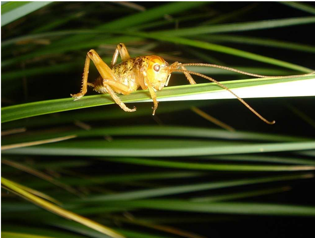
Flightless Camel cricket Parudenus falklandicus on a Tussac stem, December 2006