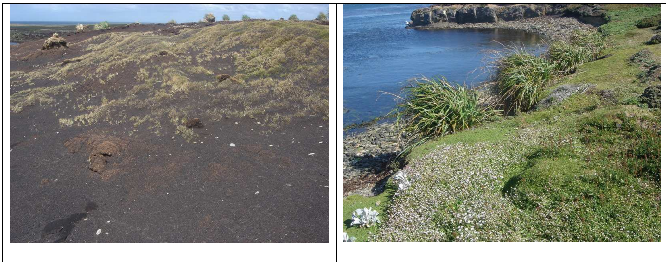
Left: Decomposed Tussac peat on northern slope, hummock stabilised by Native Rush 640 Right: European Daisy, Prickly Burr and Swordgrass by southwestern shore 712