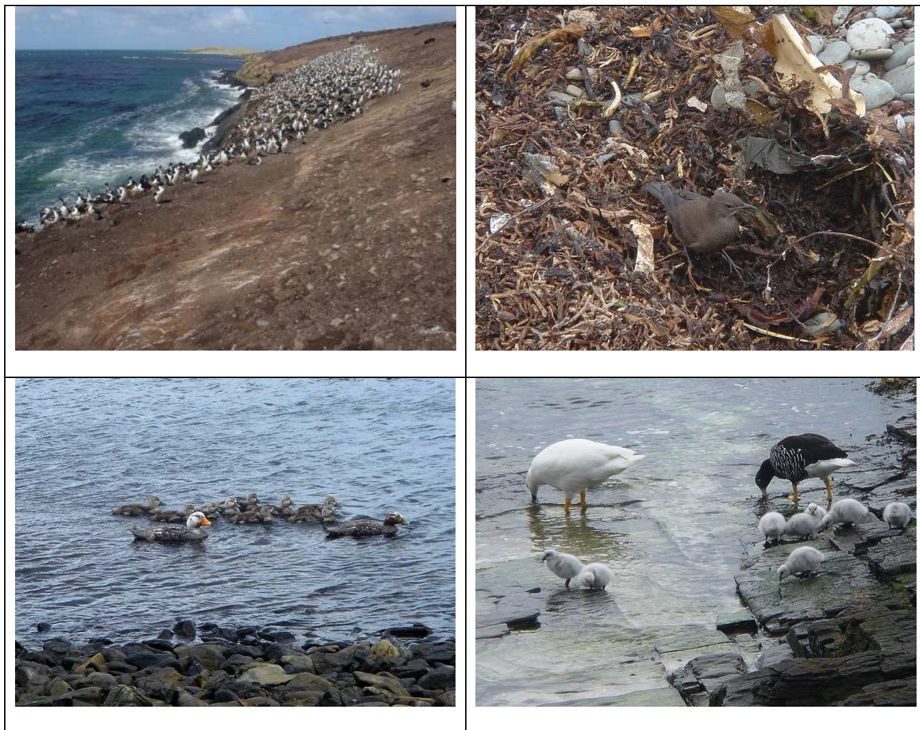
Top Left: King Shag colony on eroded northern slopes 644

2006 that had not been seen in 1997. The two Gentoo Penguins were apparently only resting with Magellanic Penguins on a beach but the Speckled Teal was definitely breeding and the Chiloe Wigeon was probably breeding at one of the very small ponds set amongst lush grassland and Arrow-leaved Marigold with Spike-rush. A total of 38 species has now been recorded on or close to the island, of which it is likely that 31 species breed at least in some years if not annually.