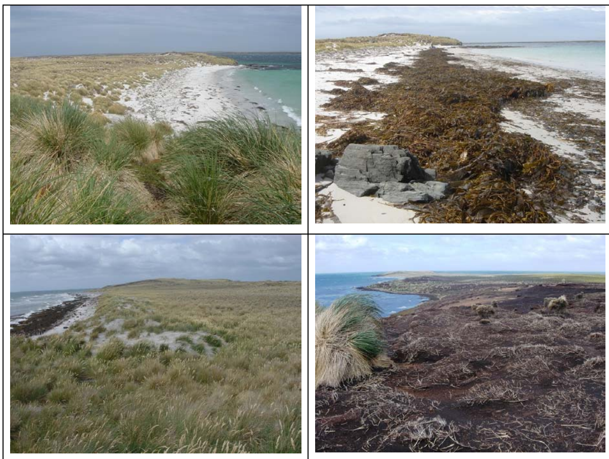
Top Left: Landing Bay from campsite on day of arrival 617