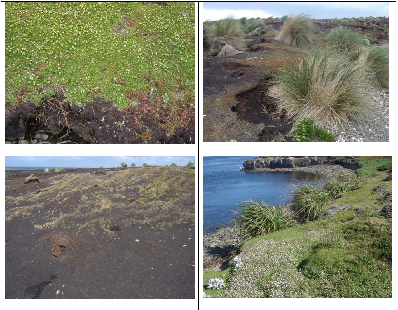
Top Left: Buttonweed and a little Sheep's Sorrel covering hard peat surface, south coast 604